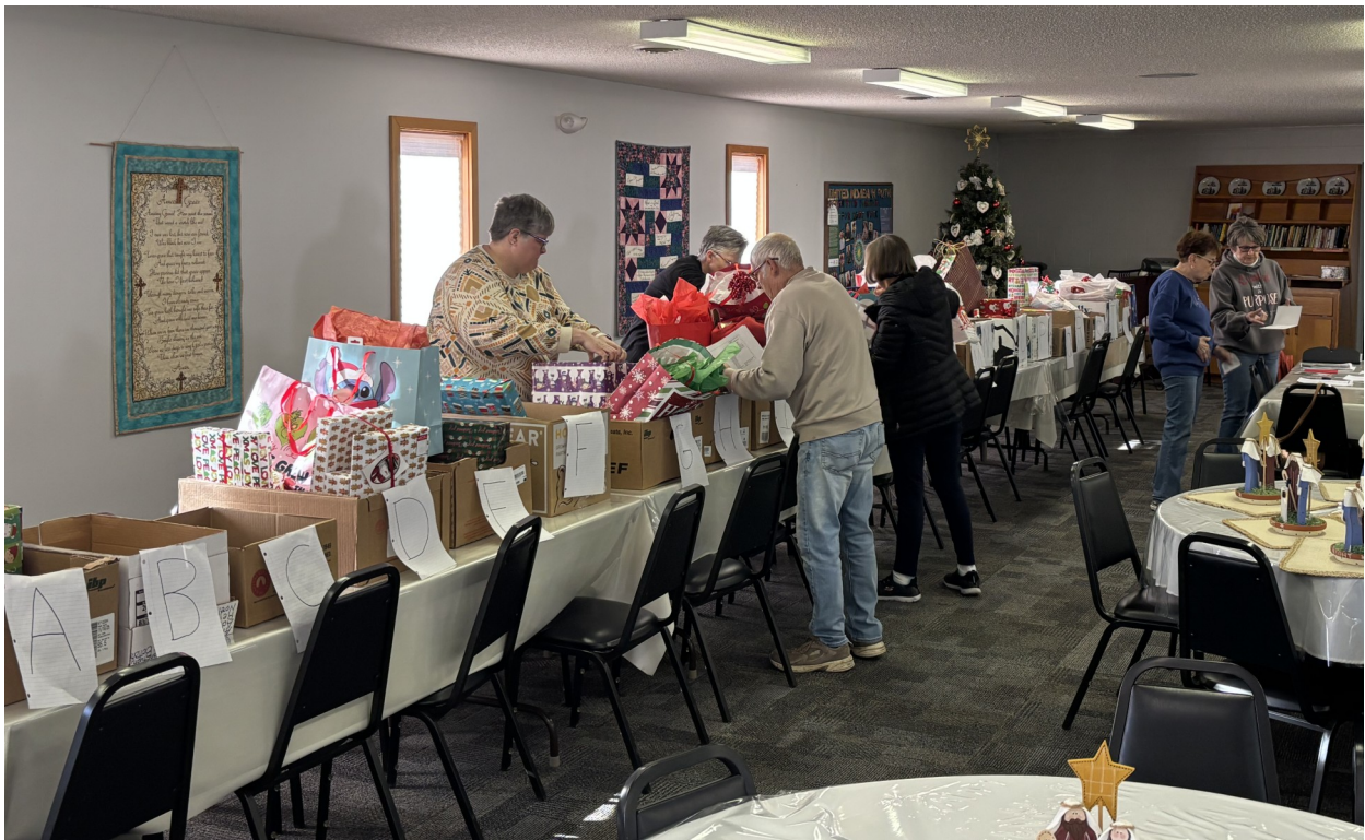
Above: Members of the Christmas Cheer Committee readying the gifts for distribution day.