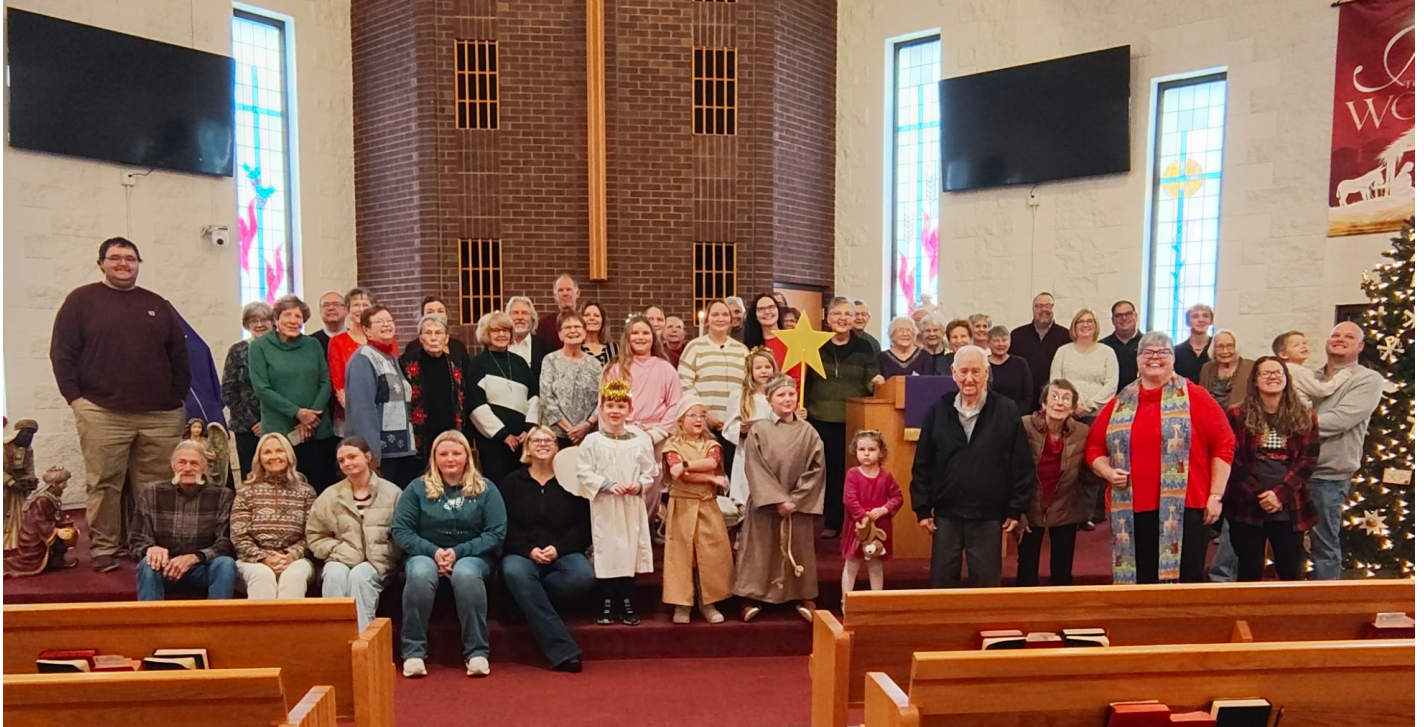
Above: Those in attendance for the Dec. 7th 2025 Christmas Program

The Christmas Program for 2025 was held on December 7th during the 10am Worship service. This was a no rehearse play, and everyone in Worship that day had a chance to participate. It was an enjoyable and easy way to celebrate the Advent season. A thanks to all those who helped pull it together for a fun time had by all!