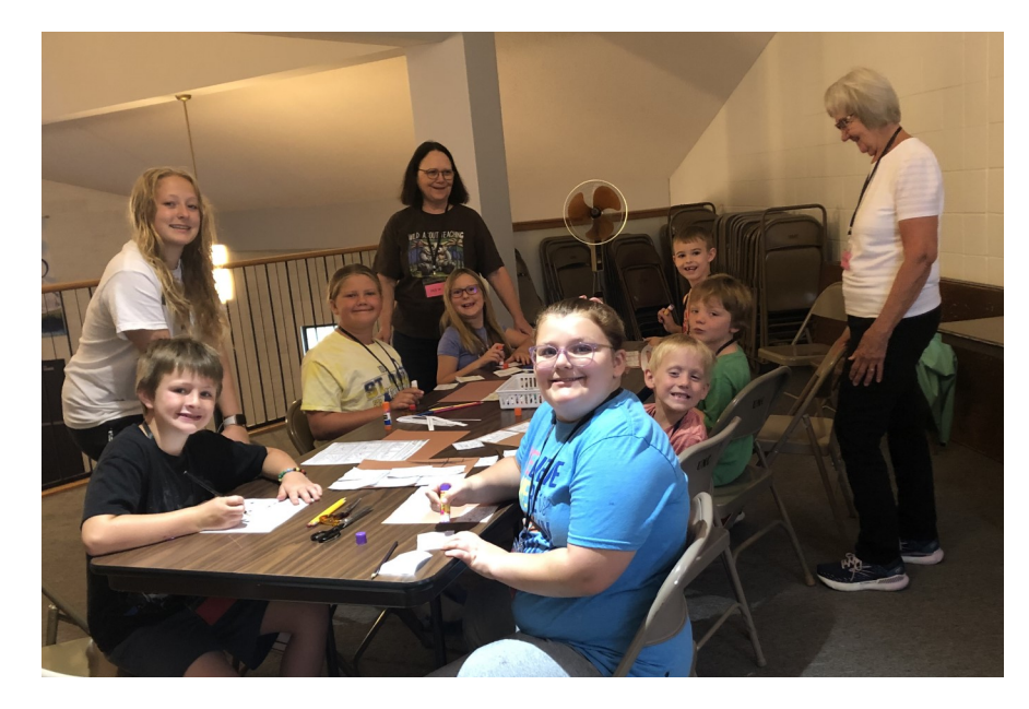
The picture above and to the left are from the kids during VBS classroom time.

The picture below is a group learning the songs along with the actions that they learned during VBS.