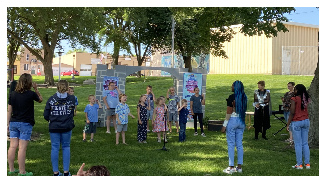
Pictured above: the VBS kids along with the youth leaders singing (with actions) during Worship in the park

Worship service was held at St. Paul City Park on July 9th, 2023. This was a joint venture along with St. Mark's Lutheran and the Presbyterian Churches. The kids from VBS got to show off many of the things they had learned during the previous week at VBS.